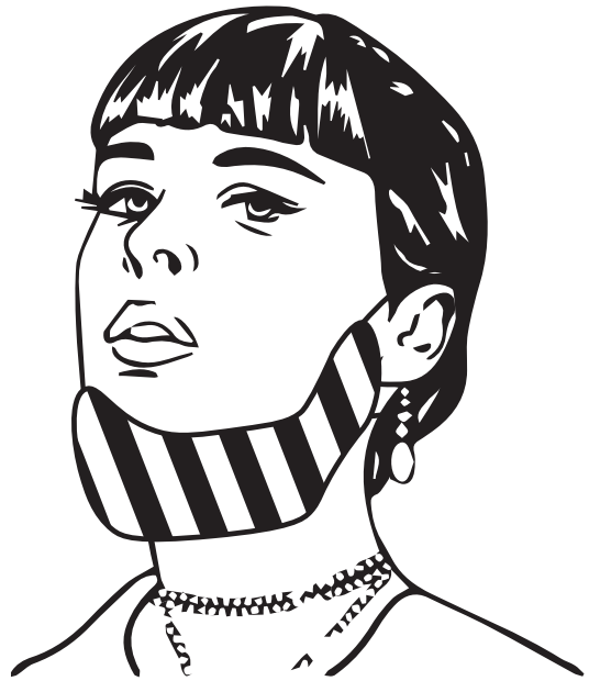
"THE NECK BEARD"