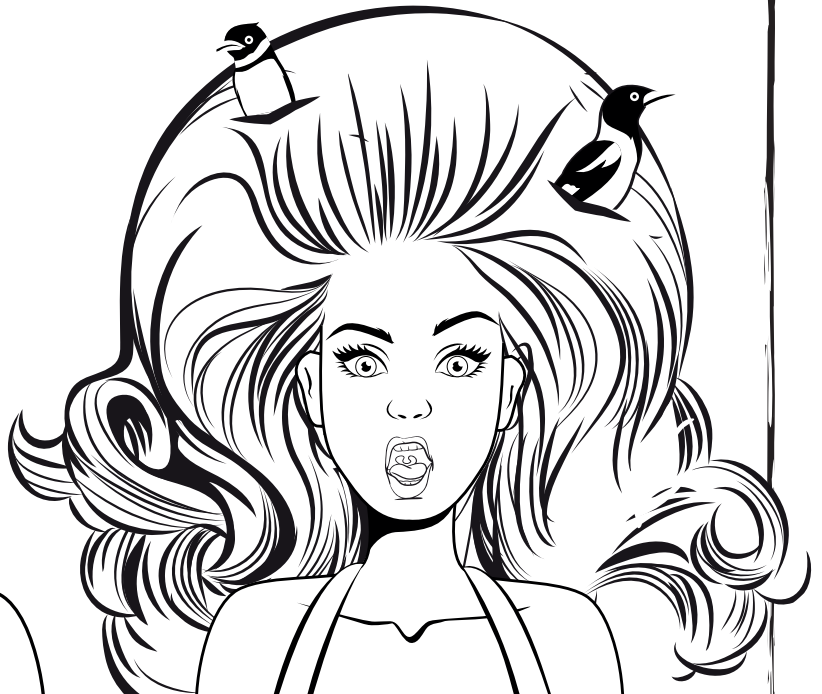
"THE BIRD'S NEST"