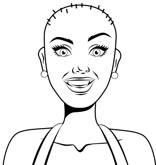
"NO HAIR - DON'T CARE"